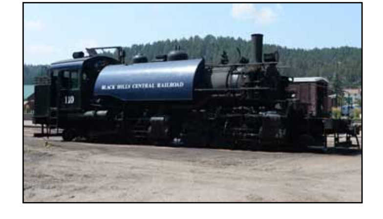
Steam Locomotives Black Hills Central Railroad #110

The Black Hills Central Railroad owns five steam engines and two diesels. Steam engines #110 and #104 are used regularly, while #7 is on display and #108 is being restored. Diesel #63 is primarily used during the first departure of the day and when a steam engine is receiving scheduled maintenance. Diesel #1 is used in the yard during the winter to switch cars in and out of the Engine House for maintenance. Our passenger cars are pictured below with the season they are primarily used and the seating each offers. All seating is first come, first serve. The cars furthest from the engine on the trip to Keystone will become the cars closest to the engine on the trip from Keystone to Hill City.