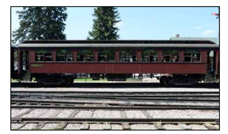
Hillyo Coach #10800 (Winter Only) +